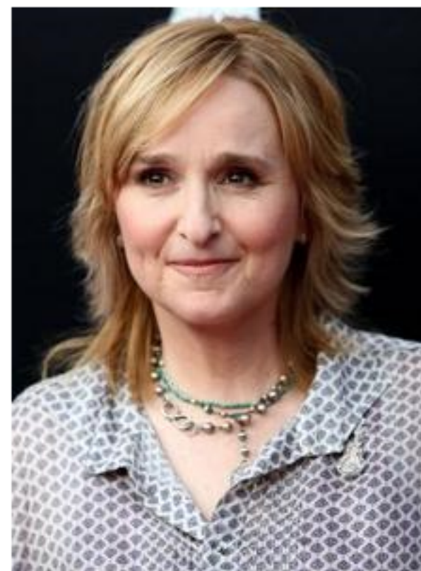
Melissa Etheridge arrives at a special live performance by Melissa Etheridge held at the Universal City Walk's Hard Rock Cafe on September 30, 2008

LOS ANGELES, CALIF. -- Notable breast cancer survivors along with America's most acclaimed physicians, wellness experts and spiritual healers are joining together to share their advice in "Breast Cancer: The Path of Wellness & Healing," a groundbreaking new DVD"